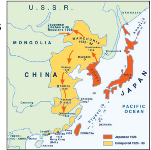
Japanese Expansion in the 1930s.

the public supported military government and military leaders such as Hideki Tojo who ruled in the name of the emperor. Japan had been industrializing very quickly. It needed more raw materials than the islands could supply so Japan looked to other areas to conquer. Manchuria, the northeast region of China, had iron and coal. Japan successfully invaded in 1931 and began to extract those resources. They continued to expand into southern China during the rest of the decade prior to the start of World War II.