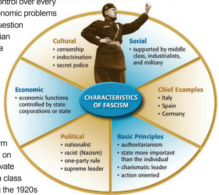
Characteristics of Fascism

Both Communism and Fascism used aspects of totalitarianism as part of their governments. In general, both used dictators, only allowed one political party, and denied many individual rights. Police terror was used for control and to get rid of any opposition. Controlling media sources (newspapers, television, radio etc.) with propaganda and limiting what was reported helped influence what people thought. However, Fascism believed in an extreme form of nationalism and pride in the country, while Communism focused on the spread of their beliefs worldwide. Communism did not allow private property and eliminated social classes. Fascism believed that each class had a role to play in society and supported private property. During the 1920s and 1930s, four major totalitarian governments developed – one was Communist, the other three were Fascist.