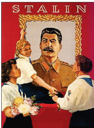
Soviet Propaganda Poster

After Vladimir Lenin's death, Joseph Stalin took power. He wanted to strengthen his power and the Communist state. He used his secret police to stop any riots and arrest or kill anyone who spoke out against him. In 1933, he began the Great Purge to