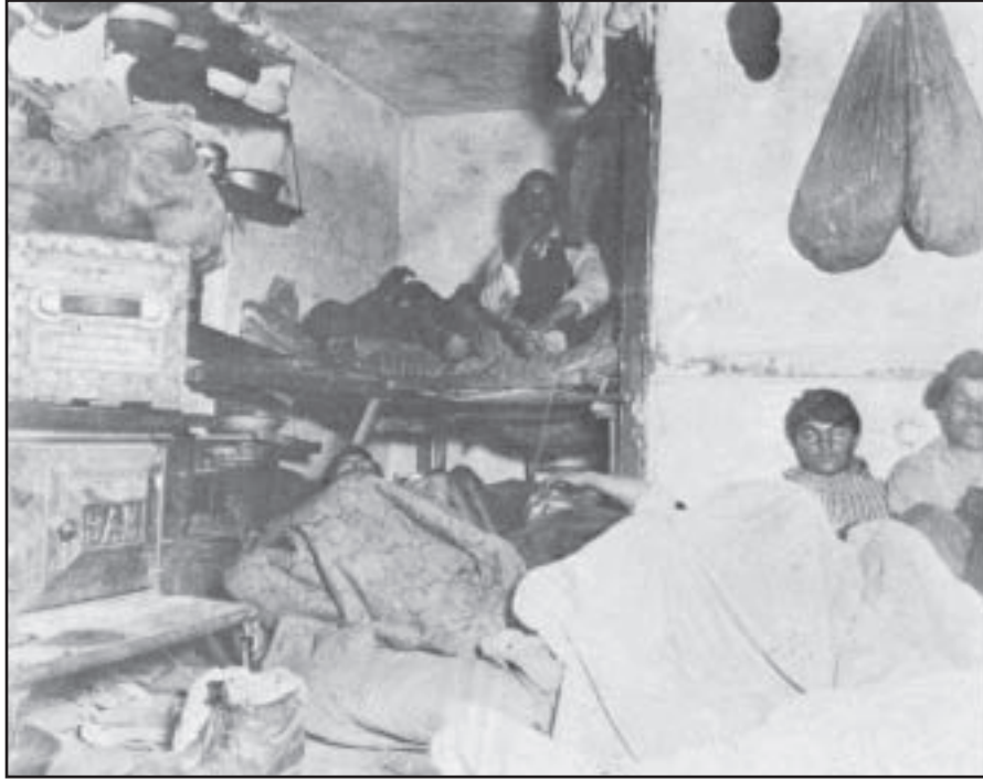
“Lodgers in a Bayard Street Tenement”