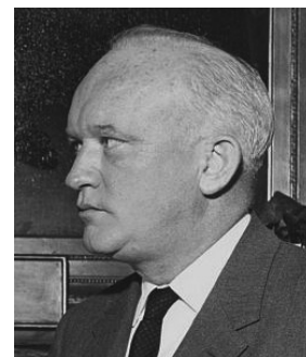
James B. Donovan (1962)

2. How did Donovan’s choices affect his family? What was their reaction? How did his choices affect his legal career and his relationship with his law firm? What personal risks to his safety did he endure? What were his motivations for these difficult choices?