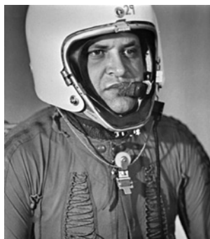
Francis Gary Powers

The U-2 spy plane is a technological marvel that pushes the extreme limits of powered flight; it can fly for more than 10 hours with a range of 7,000 miles, farther than most commercial airliners, and can reach altitudes of 70,000 feet. Despite being fragile and difficult to maneuver, it has proved valuable from its early flights over the Soviet Union, to the modern conflict in Afghanistan. Although now equipped with a computerized instrument panel and digital photography equipment, the U-2 will soon be replaced by drones.