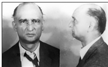
Mug shots of Rudolf Ivanovich Abel

In all criminal prosecutions, the accused shall enjoy the right to a speedy and public trial, by an impartial jury of the state and district wherein the crime shall have been committed, which district shall have been previously ascertained by law, and to be informed of the nature and cause of the accusation; to be confronted with the witnesses against him; to have compulsory process for obtaining witnesses in his favor, and to have the assistance of counsel for his defense.