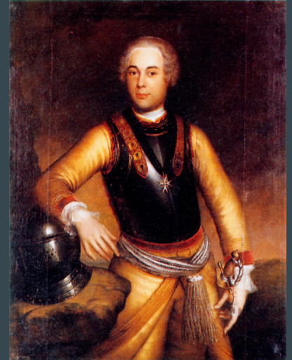
Hans Hermann Katte