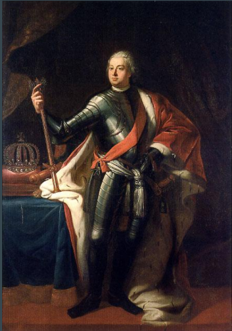
Frederick William I